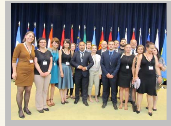
U.S. PROFESSIONAL FELLOWS CONGRESS

We invite professionals from any region of Bulgaria, Hungary, Romania, and Slovakia to apply for participation in a 42-day fellowship in the U.S.A. We encourage submissions by professionals who are actively involved in programs related to citizen participation and advocacy (NGO/civil society development), civic education organizations, citizen advocacy groups, community activists and/or community organizers who work with minority groups. The overall goal of the program is to provide a professional development opportunity for mid-level emerging leaders; create a forum for American and foreign participants to collaborate and share ideas and strategies; and build a global network of professionals able to work effectively in an interconnected environment.