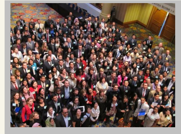
U.S. PROFESSIONAL FELLOWS CONGRESS

We invite professionals between the age of 25-40, from any region of Bulgaria, Hungary, Romania, and Slovakia, to apply for participation in a 42-day fellowship in the U.S.A. We encourage submissions by professionals fluent in English and actively involved in programs related to citizen participation and advocacy (NGO/civil society development), civic education organizations, citizen advocacy groups, community activists and/or community organizers who work with minority groups. The overall goal of the program is to provide a professional development opportunity for mid-level emerging leaders and build a global network of American and foreign professionals so that they can collaborate and share ideas and strategies in an interconnected environment.